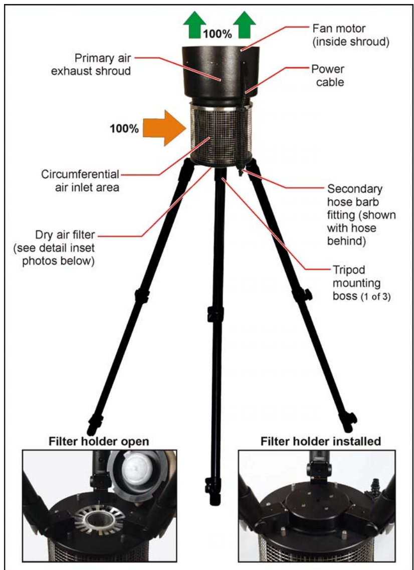
Figure 3: Airflow patterns for the SASS 4100 two-stage aerosol collector.

The disposable capture element is a 43.4 mm O.D. x 3 mm thick micro-fibrous filter ultrasonically bonded to a circular frame of 59 mm diameter and 5 mm thickness. The fibrous media is up to 50X more efficient than a conventional glass or cellulosic material because each fiber incorporates a built-in electric field that captures