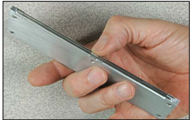
Figure 4: SASS 4000 Concentrator blade.

Figure 5 shows typical data of sampler collection efficiency as a function of particle size. The collection efficiency is alternatively given as an ‘enhancement factor’ and as an equivalent secondary flow rate. That is, the actual secondary flowrate is about 265 LPM, but due to the concentrating nature of the two-stage sampler, it behaves as if the second stage were operating at a larger airflow.