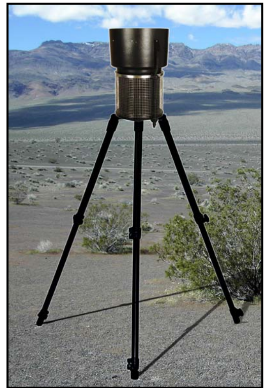
Figure 1: SASS 4100 two-stage dry aerosol collector.